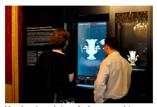
Manufacturing technique of soft-paste porcelain

providing the visual aspect so characteristic of this art.