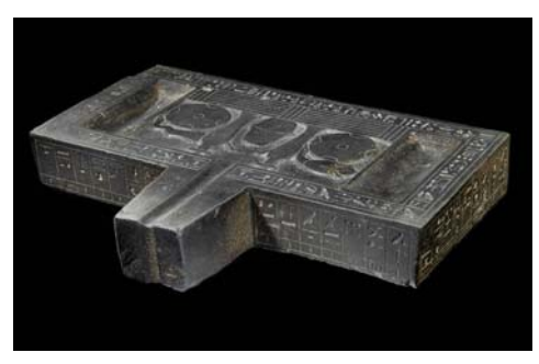
Offering table of Horiraa, chancellor to the king C. 664–525 BC. Basalt. Musée du Louvre, Department of Egyptian Antiquities