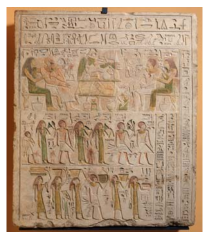
Stela of Sakherty, chamberlain, C. 1970–1900 BC Painted limestone. Musée du Louvre, Department of Egyptian Antiquities