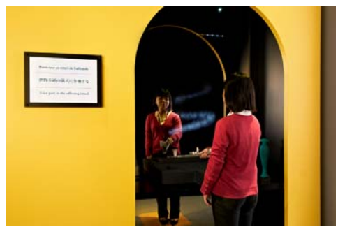
Take part in the offering ritual