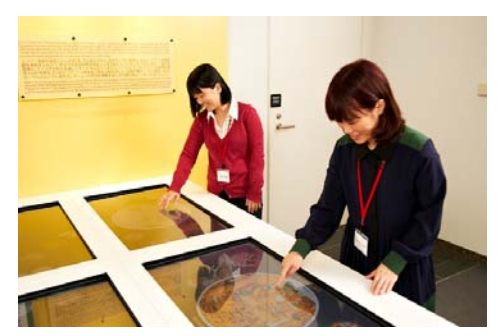
Discover the conventions of Egyptian art