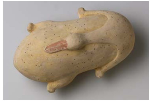
Model of a plucked and trussed goose C. 2700–2200 BC. Painted limestone. . Musée du Louvre, Department of Egyptian Antiquities