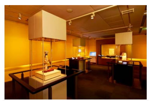
Presentation room

Louvre - DNP Museum Lab Eighth presentation in Tokyo