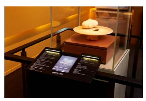
Digital caption panel